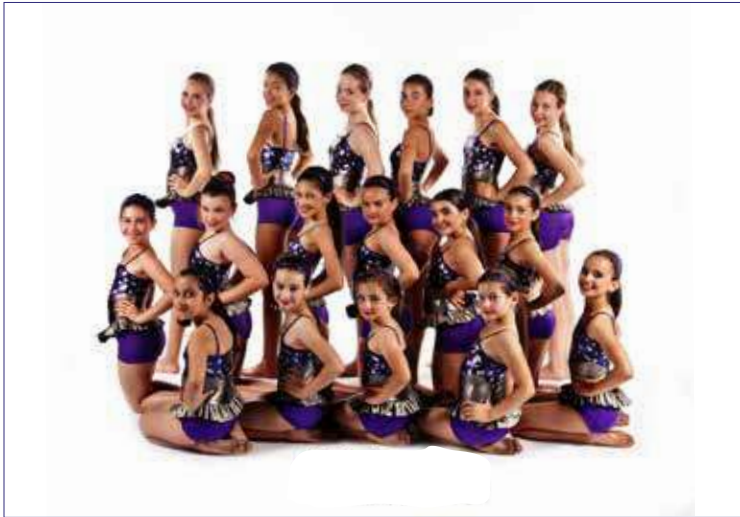
90 DAYS GUARANTEE