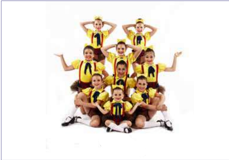
I'VE GOT NO STRINGS