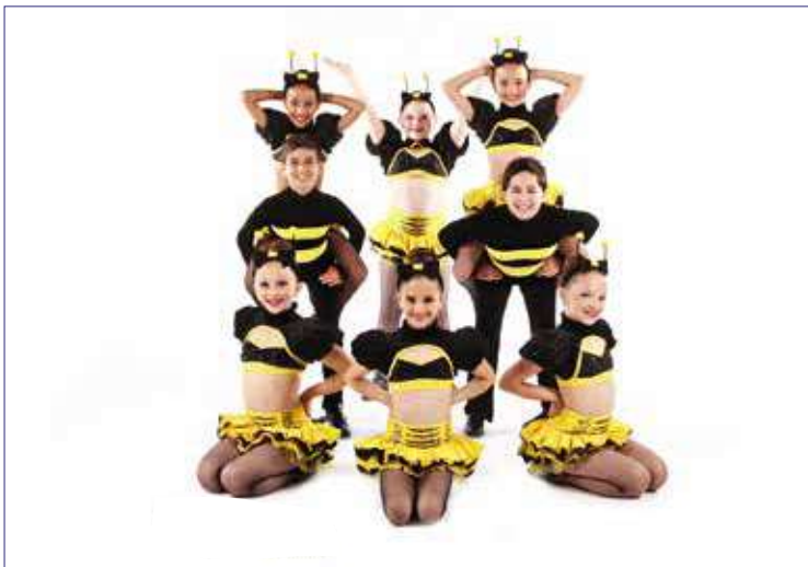
HONEY BOO BOO