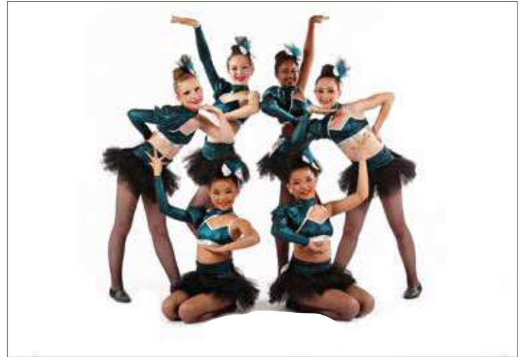
EVERYTHING AT ONCE