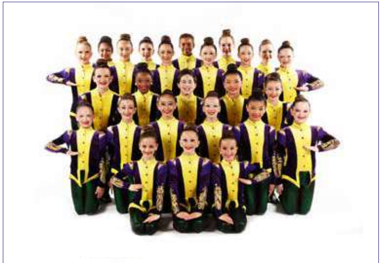
WHICH WITCH IS WHICH? - SOLDIERS