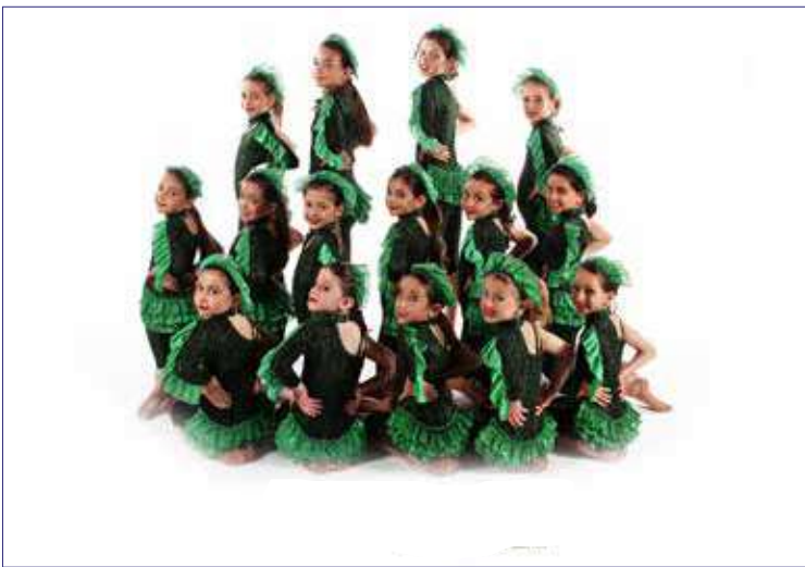
JEREMIAH WAS A BULLFROG