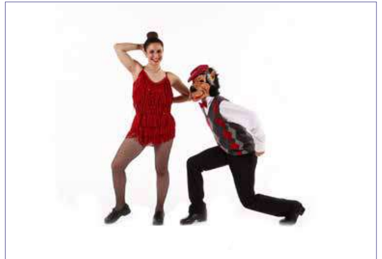
MARILYN AND THE WOLF