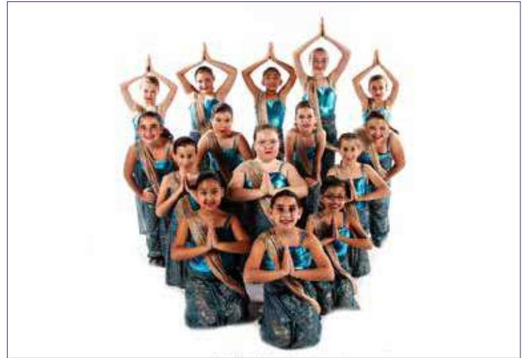
WALK LIKE AN EGYPTIAN