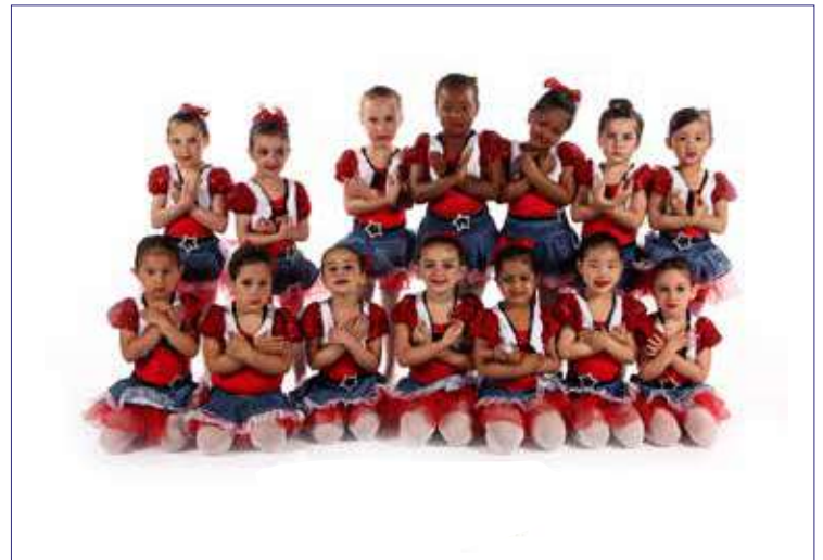
WHEN SOMEBODY LOVES ME