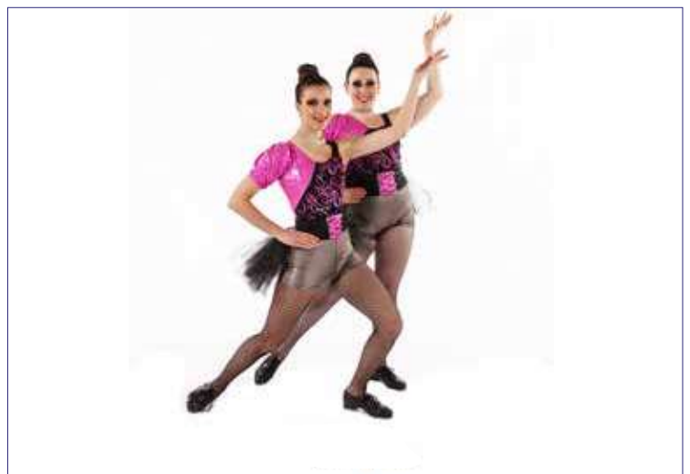
WANNA HAVE FUN