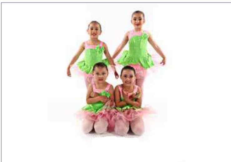
FLY TO YOUR HEART