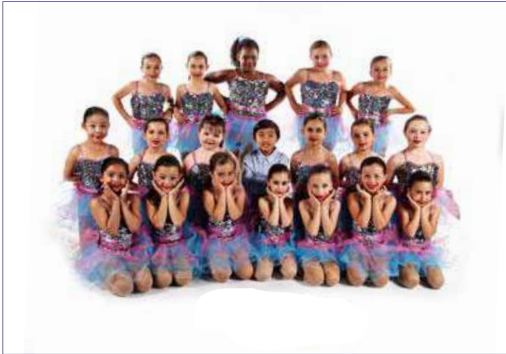
LITTLE BITTY PRETTY ONE