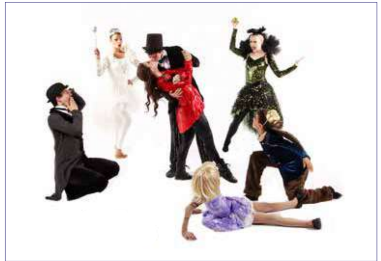
WHICH WITCH IS WHICH? - CHARACTERS