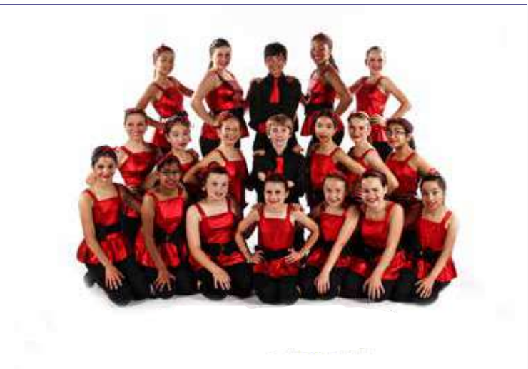
BLACK HORSE AND CHERRY TREE