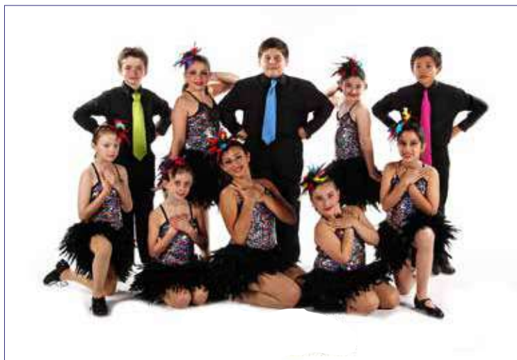
TAP WITH SOMEBODY