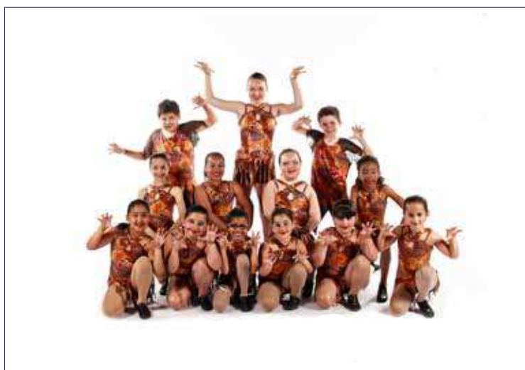
CAN'T WAIT TO BE KING