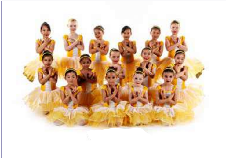
WHEN I FALL IN LOVE