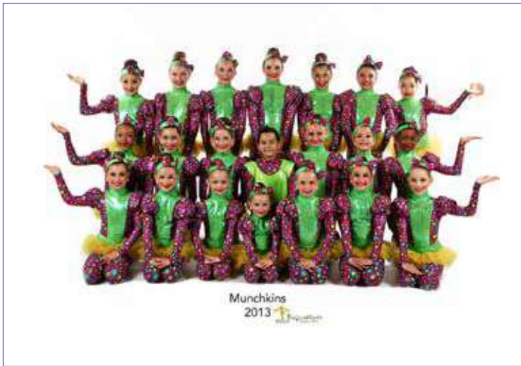
WHICH WITCH IS WHICH? - MUNCHKINS