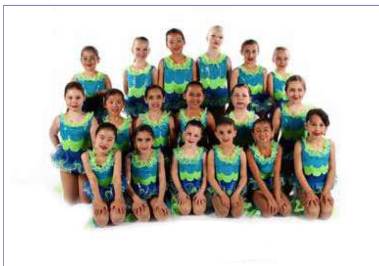
UNDER THE SEA