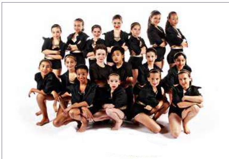
BAD TO THE BONE