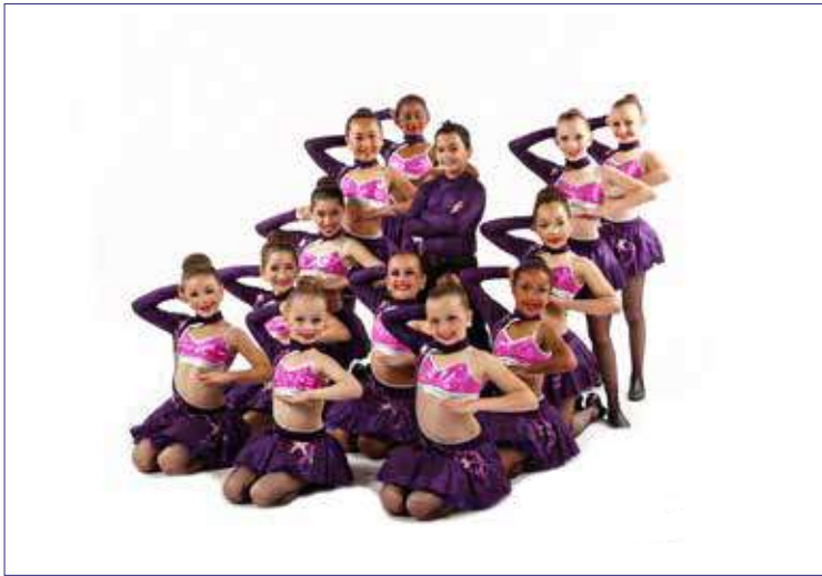
BABY I'M A STAR