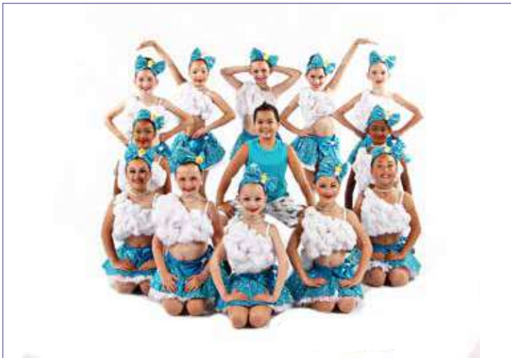
OH WHAT A SPLASH