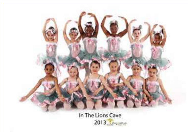
IN THE LIONS CAVE