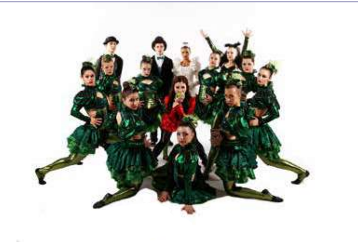
WHICH WITCH IS WHICH? - EMERALD CITY