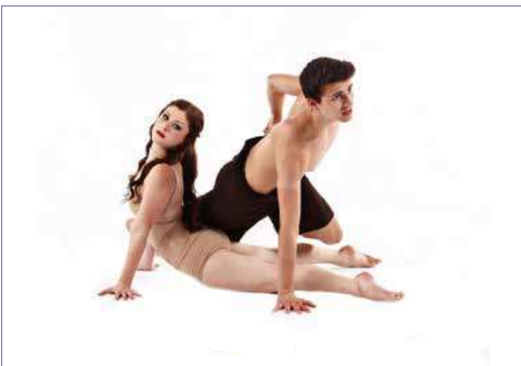
SKIN AND BONES