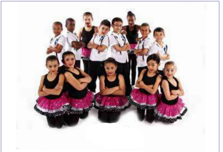
BUST A MOVE