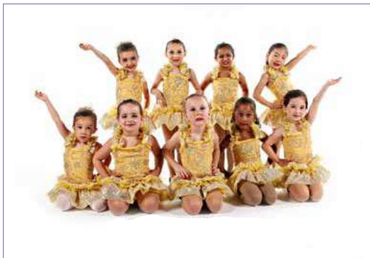
ITSY BITSY YELLOW POLKADOT BIKINI