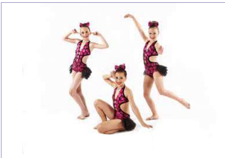
BIG NOISE FROM WINETKA