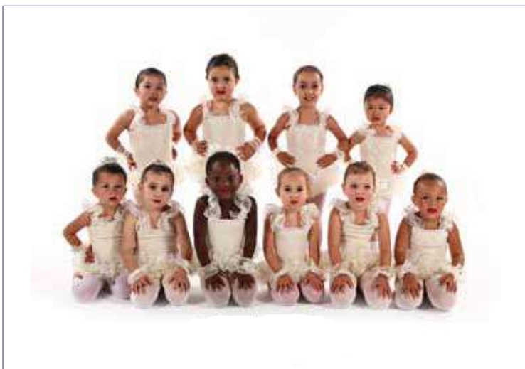
MOTHER KNOWS BEST