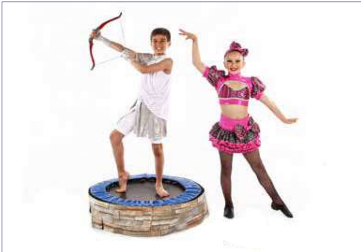
CUPID'S WISHING WELL