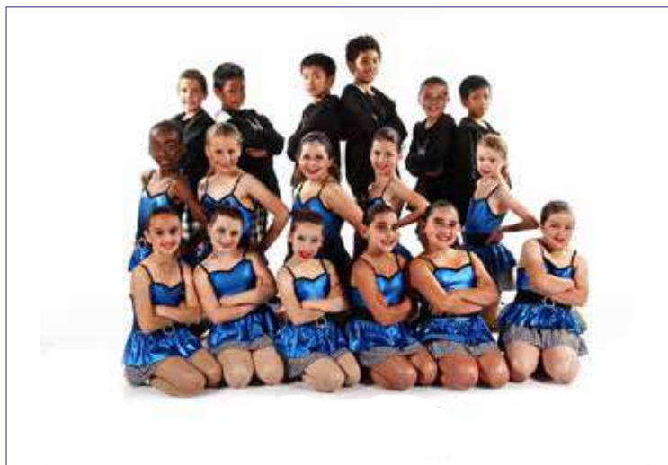
TURN UP THE MUSIC