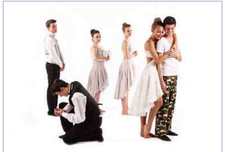
FOREVER HOLD YOUR PEACE