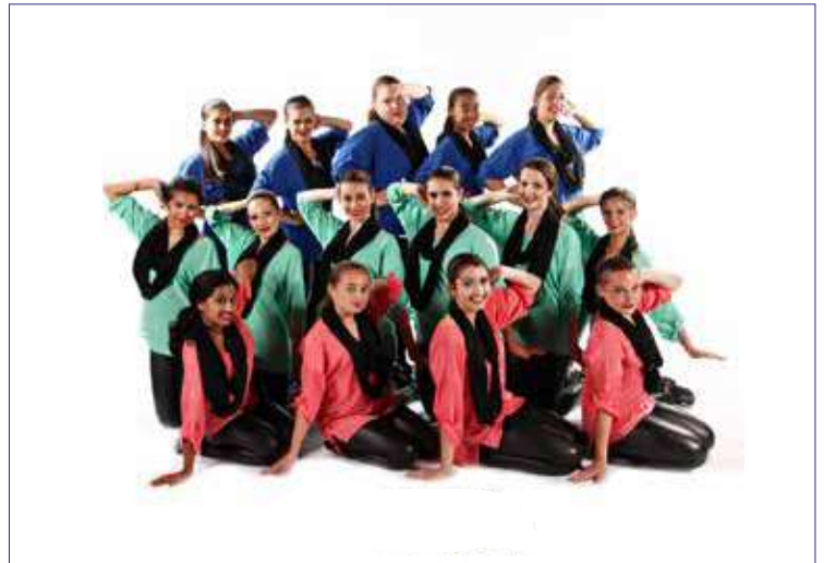
STOMP TO MY BEAT