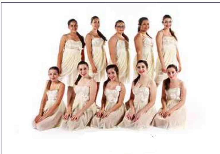
SUMMER TIME SADNESS