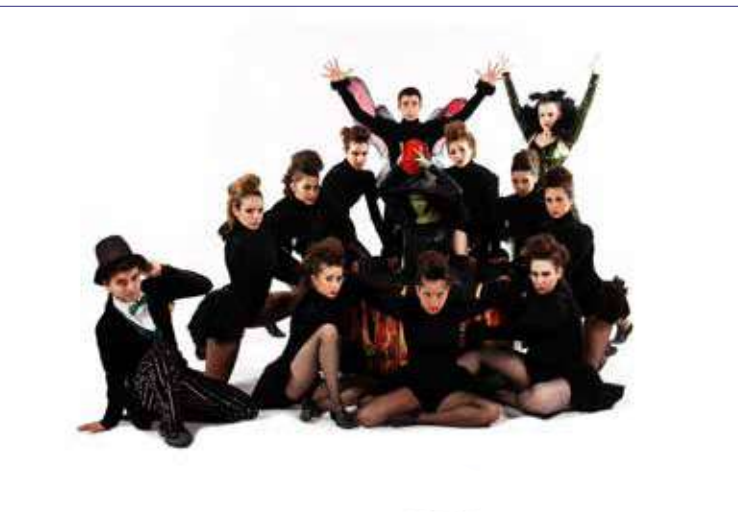
WHICH WITCH IS WHICH? - MONKEYS