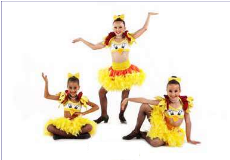
JUST US CHICKS