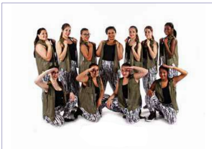
SEVEN NATION ARMY