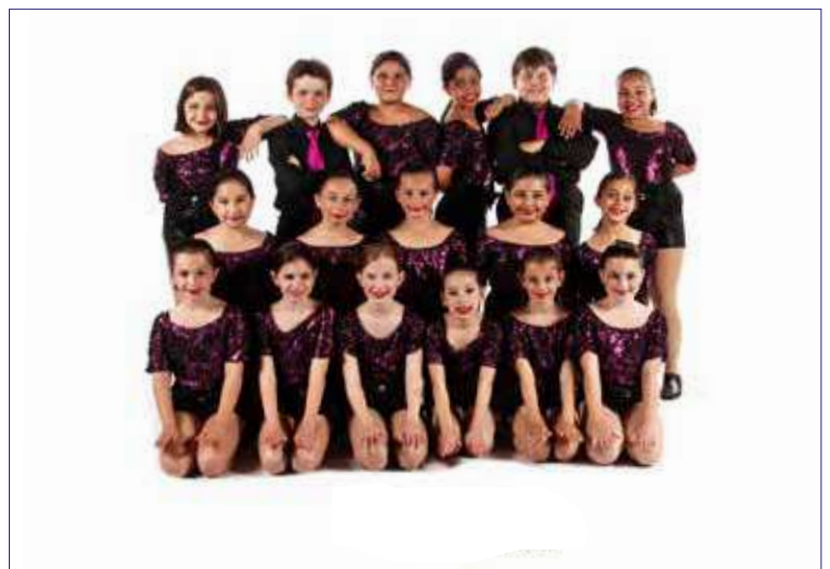
GLAD YOU CAME