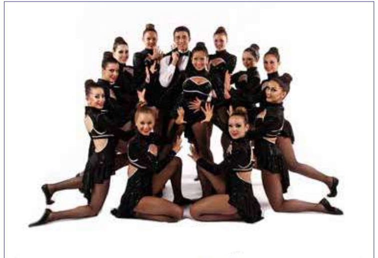
DOUBLE O SEVEN