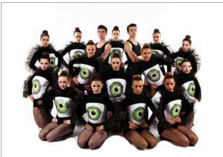
EYEZ ON US