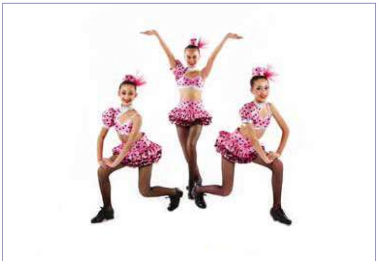
HEART OF GLASS