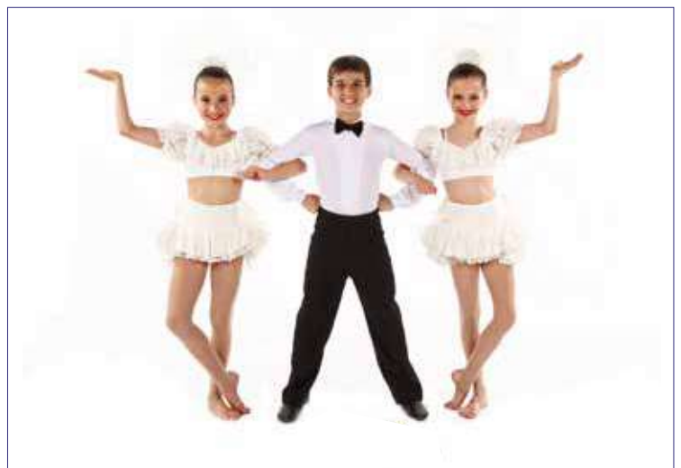
SAVE THE DATE