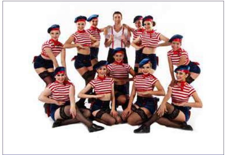
ALHORS EN DANSE