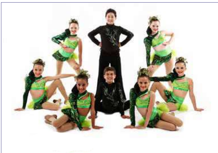
JACK AND THE BEANSTALK